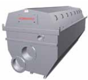
Type 1, Tank

The Hydrotech Drumfilter is available in two drive system versions; direct drive and chain transmission. The direct drive is used on the two smallest drum sizes with 0.5 and 0.8 m drum diameter. On the chain transmission, Hydrotech has an option to deliver with maintenance free plastic chains.