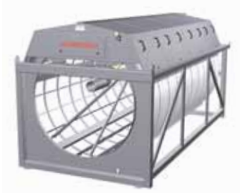
Type 2H, Open inlet