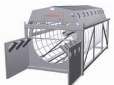
Type 2, Wing walls