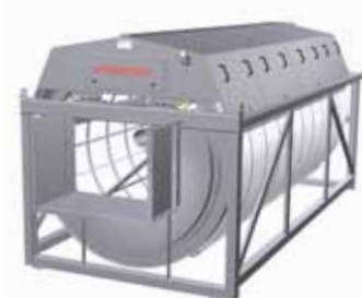
Type 2F, Open inlet (incl. connection for inlet channel)